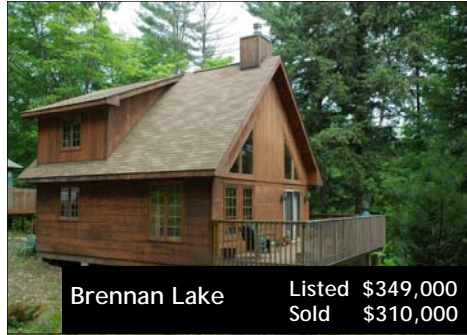
Brennan Lake Listed $349,000 Sold $310,000