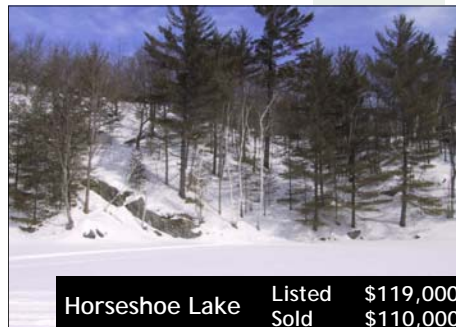
Horseshoe Lake Listed $119,000 Sold $110,000